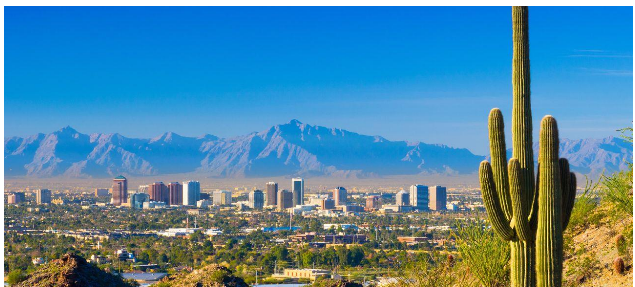
By Holden O'Neal